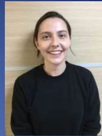
Artemis Proddow Hedgehogs (Monday-Thursday)